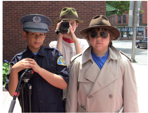
Campers with camera & tripod shooting "Dash Riprock" in downtown Brattleboro this summer.