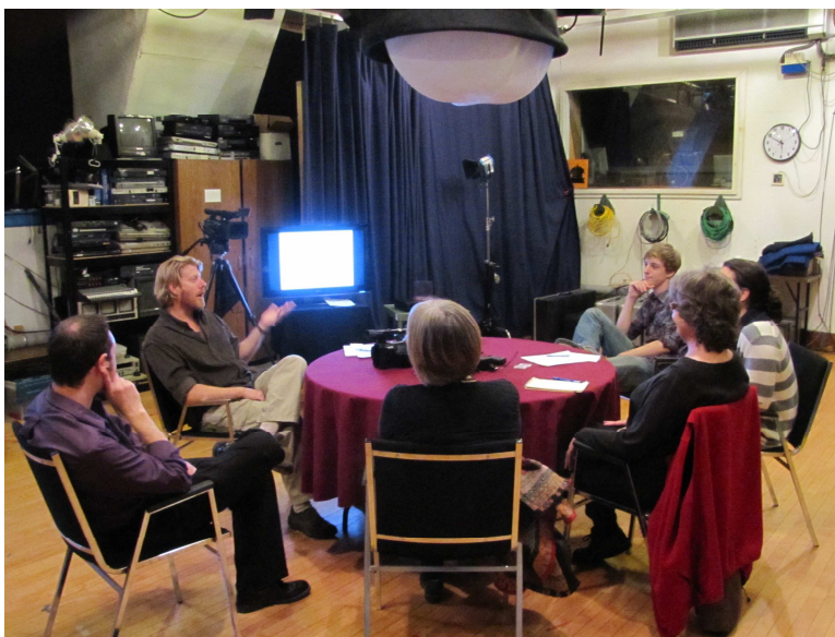
Though the BCTV Studio is busier than ever as a facility for trainings (left) and studio productions (below), it is in need of a major renovation.